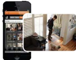
Innovative Mobile and Web Visual Views