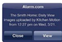
Industry Leading Alarm.com Interactive Services