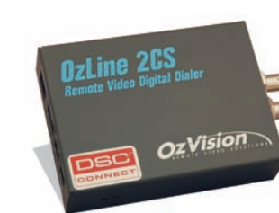
OZLINE2CS OZLINE REMOTE VIDEO DIGITAL DIALER