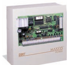
PC4820 2-READER ACCESS CONTROL MODULE