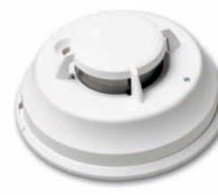
WS4916 WIRELESS PHOTOELECTRIC SMOKE DETECTOR