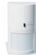
WS4904 WS4904P WIRELESS PASSIVE INFRARED DETECTORS