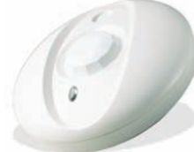
AMB-500 ADDRESSABLE CEILING-MOUNT PASSIVE INFRARED DETECTOR