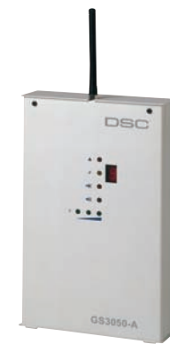
GS3050-A/ GS3050-I GSM UNIVERSAL WIRELESS ALARM COMMUNICATOR