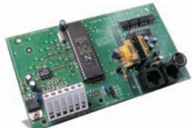
PC4401 DATA INTERFACE MODULE