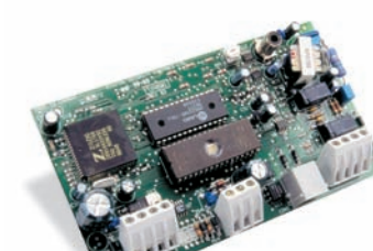
ESCORT™ 4580 TELEPHONE INTERFACE AND AUTOMATION CON- TROL MODULE