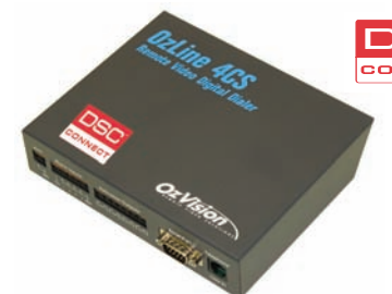
OZLINE4CS OZLINE REMOTE VIDEO DIGITAL DIALER