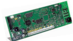
T-LINK™ TL250 INTERNET ALARM COMMUNICATOR