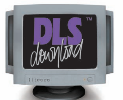
DLS2002 DOWNLOADING SOFTWARE