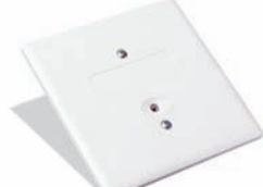
AML-770 LOOP ISOLATOR MODULE