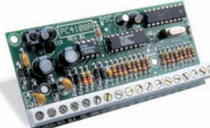
PC4108/PC4116 8/16 HARDWIRE ZONE EXPANDERS