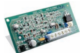
AMX-400 LOOP REPEATER/ ISOLATOR MODULE