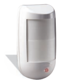
AMB-600 ADDRESSABLE PET-IMMUNE PASSIVE INFRARED DETECTOR