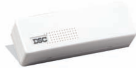
AMP-700/AMP-701 AMP-702/AMP-704 ADDRESSABLE CONTACT MODULES