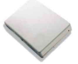
PC4164 WIRELESS RECEIVER SUPPORTS: -64 WIRELESS ZONES -16 WIRELESS KEYS