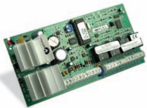
PC4204CX POWER SUPPLY RELAY OUTPUT MODULE COMBUS REPEATER