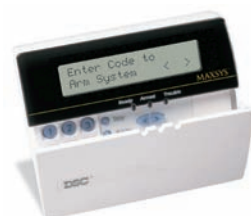
LCD4501 PROGRAMMABLE- MESSAGE LCD KEYPAD