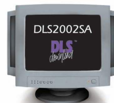
DLS2002SA SYSTEM ADMINISTRATOR SOFTWARE