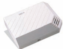
AMA-100 ADDRESSABLE GLASSBREAK DETECTOR