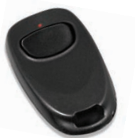
WS4938 1-BUTTON PERSONAL PANIC