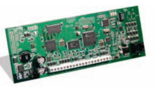
T-LINK™ TL300 UNIVERSAL IP ALARM COMMUNICATOR