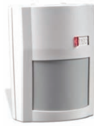
AMB-300 ADDRESSABLE PASSIVE INFRARED DETECTOR