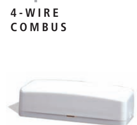
WS4945 WIRELESS DOOR/ WINDOW CONTACT