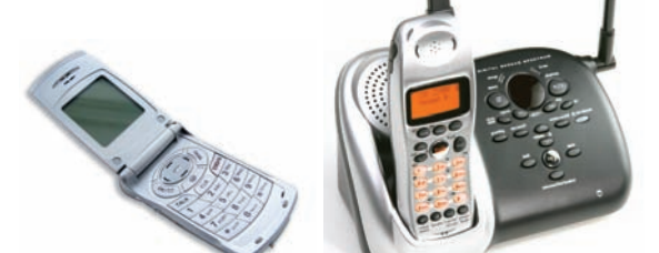
LOCAL/REMOTE CONTROL WITH VOICE PROMPT