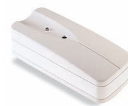
WLS912L-433 WIRELESS GLASS- BREAK DETECTOR