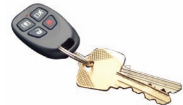
WS4939 4-BUTTON WIRELESS KEY