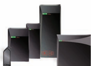
READERS POLARIS, IoPROX™ 26-BIT WIEGAND, KANTECH XSF TECHNOLOGIES